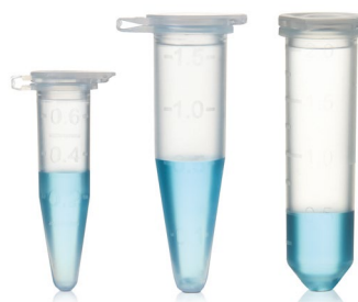
Figure 1. DNA Low Binding Snap Cap Microcentrifuge Tubes, Sustain Series.

The DNA Low Binding Snap Cap Microcentrifuge Tubes, Sustain Series, are ideal for general lab researchers in biotech, pharma, and forensics who need to ensure nucleic acid integrity in precious samples and are looking for more sustainable products. The tubes minimize loss of DNA during incubation and storage and are produced with biobased material allocated on a mass balance basis. Viscous liquids and costly reagents retained in a microcentrifuge tube affect assay accuracy and precision; with no additives or coatings, these tubes—available in 0.6 mL, 1.5 mL, and 2.0 mL sizes—offer maximum DNA recovery (Figure 1).